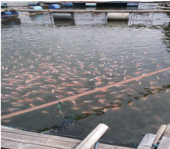
Figure 3.1 Pangauban Village Fish Cultivation