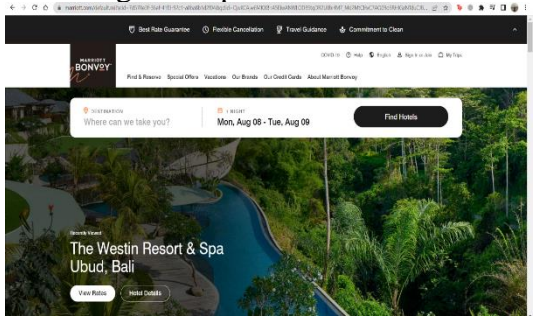
Figure 4. Marriott Bonvoy Implementation

appreciation for the hotel for customer loyalty. At The Westin Resort & Spa, Ubud, the form of customer relationship management is Marriott Bonvoy, as shown in Figure 4. It is a place for loyal consumers to stay at hotels under the auspices of Marriott, one of which is The Westin Resort & Spa, Ubud. With appreciation in the form of giving discounts and events according to the points earned.