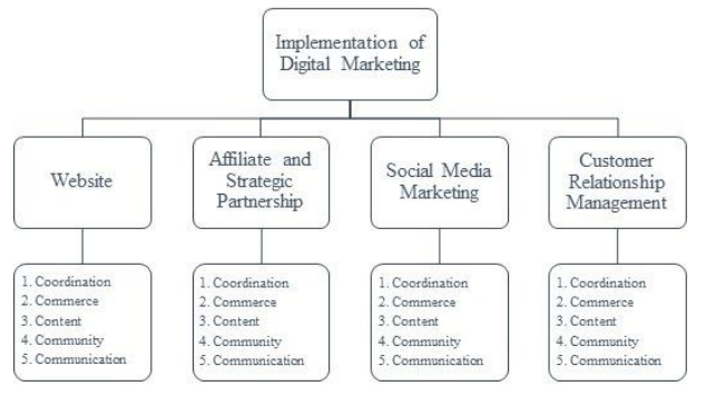
Figure 5. Description of Digital Marketing Dimensions and Indicators Outline of Digital Marketing

based on five predetermined indicators: Coordination, Content. Commerce. Community, and Communication. It is shown in Figure 5. Based on the analysis that has been carried out, it can be concluded that all digital marketing indicators have been implemented by maximizing the implementation of the social media marketing dimensions and content indicators, as well as seeking maximum implementation of social media. Besides, efforts are being made to increase room occupancy, such as increasing brand awareness on social media by implementing a monthly giveaway program.