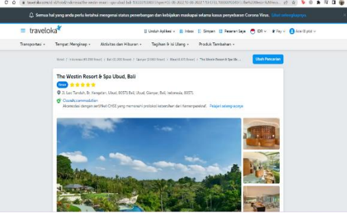
Figure 2. Online Travel Agent Implementation

containers and easily accessed by potential consumers. Furthermore, it is supported by the page views of each online travel agent.