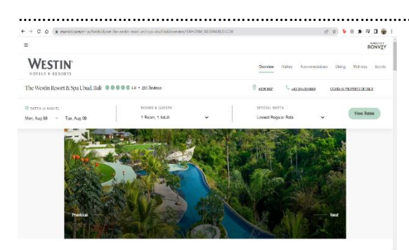
Figure 1. Website Implementation