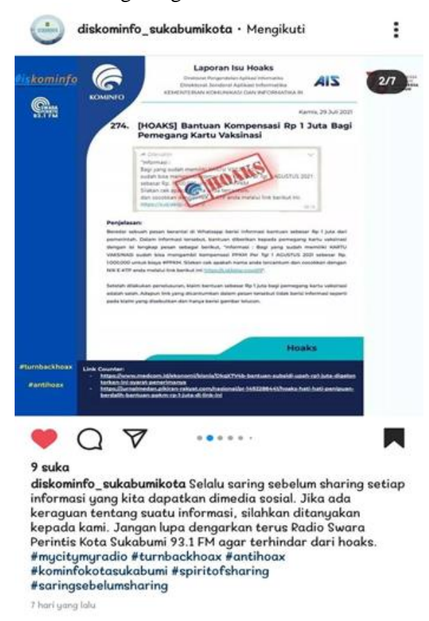
Figure 1. Hoax Handling by the Sukabumi City Communication and Information Agency with LPPL Radio Swara Perintis Sukabumi

One of the infographics uploaded by Diskominfo Sukabumi City in their Instagram account, @diskominfo_sukabumikota describes the efforts to tackle hoaxes by the Sukabumi City Communication and Information Office together with LPPL Radio Swara Perintis Sukabumi City can be seen in the following image.