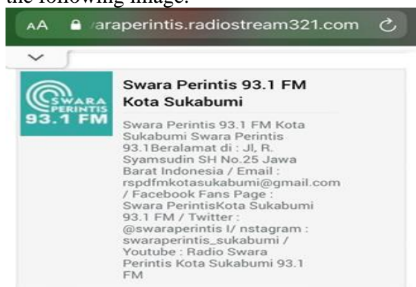
Figure 12. Radio Streaming LPPL Swara Radio Perintis Sukabumi

swaraperintis.radiostream321.com. The streaming link for the LPPL Swara Perintis Radio Sukabumi streaming link can be seen in the following image.