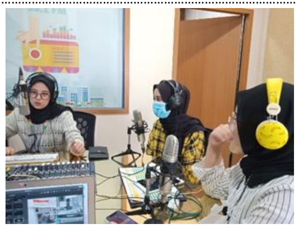
Figure 5. Talkshow with IPB Sukabumi Vocational Students